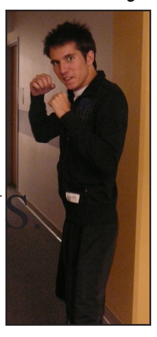
By Sean Power

The primary elections were held yesterday and the results turned out to have a greater impact than expected. It is important to remember that these are just the primary elections and the general elections will be held today.