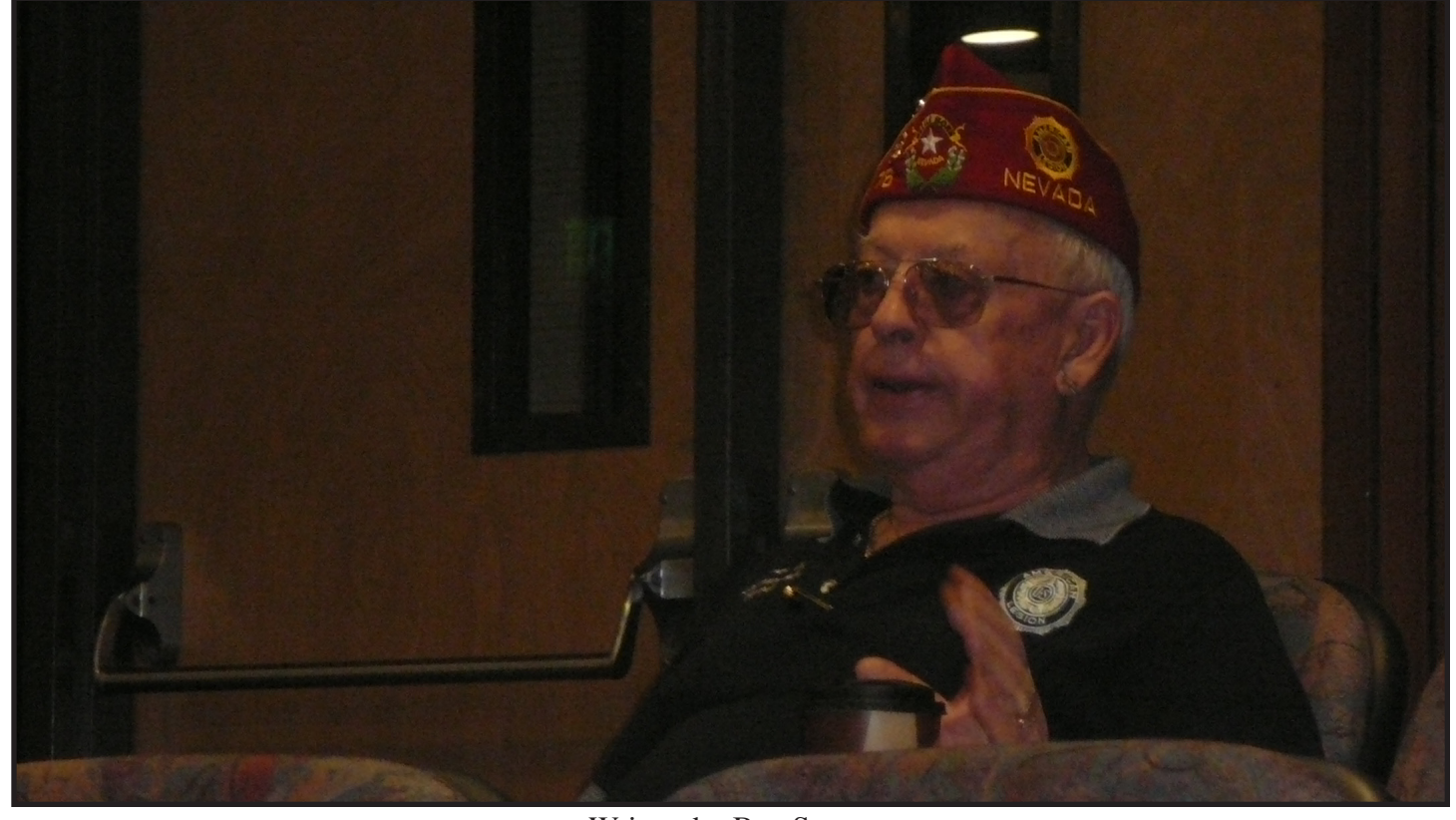
Written by Ben Syang