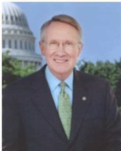
Before becoming a US Senator, Harry Reid attended NBS as a delegate from Basic High