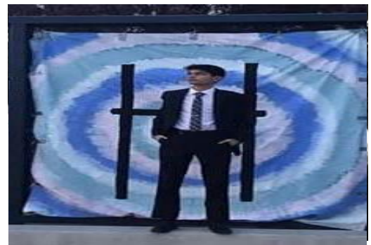
Your new secretary of state: Abhino Dagar